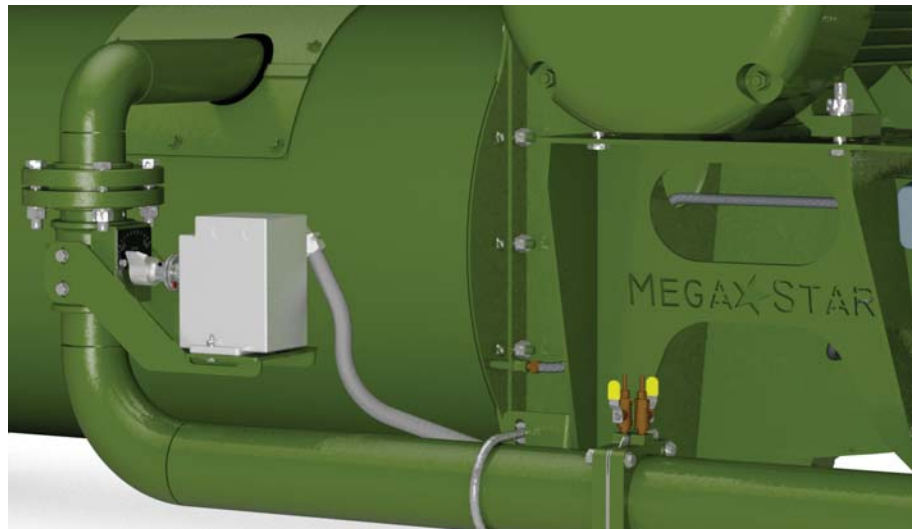
Direct coupled fuel motors eliminate the need for linkage connections.

Available in sizes ranging from a nominal 50 to 150 million Btu/hr (14,650 to 43,960 kW), the MegaStar is ready to meet your production needs. The standard design can be applied to applications up to 1500°F (815°C). Custom lengths are also available for warm-mix applications.